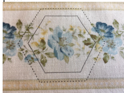
6 Stamp all parts that are needed to start your design