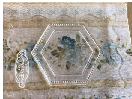
5 Fuzzy cutting is easy, you can clearly see pattern