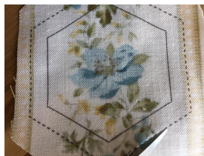
7 Once stamped, cut shapes on dotted line