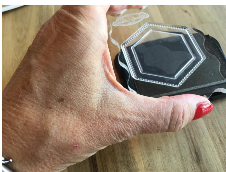
4 Choose right colour and apply ink to stamp