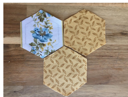
8 Lay parts you stamped and cut in right pattern