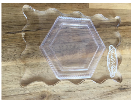
3 Stick stamp with smooth side to acrylic block